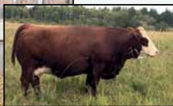
Arnold's Eveready E5092 dam's twin sister JNR 315Z

GREAT GUNS KARL 17C ARNOLD'S EVEREADY E5092 389926 MISS ARNOLD T5092