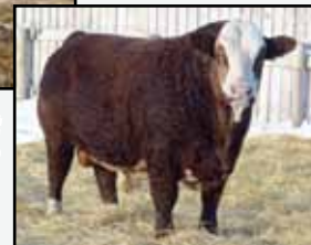
Brink Bullet Proof A342

BRINK HUCKLEBERRY Y158 BRINK BULLET PROOF A342 1138132 BRINK R785