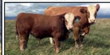
26E & dam