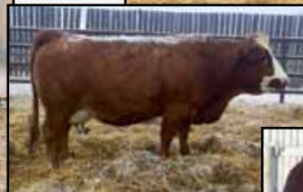
JNR Raina 357A