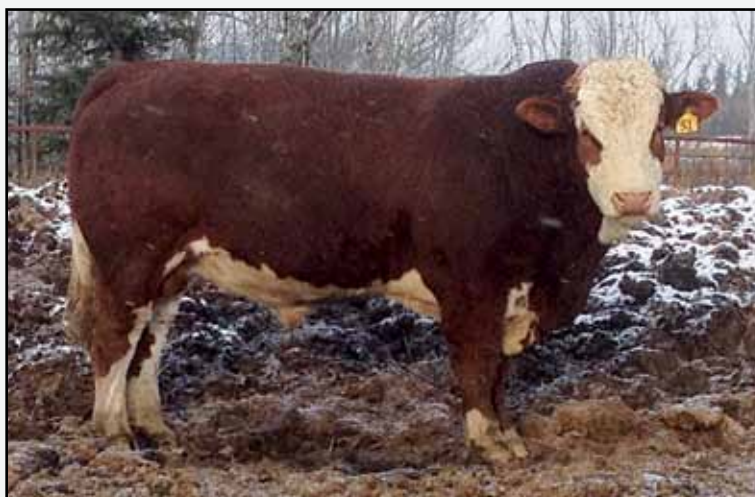
Lone Stone Baron 104C

If you have any questions about these animals, feel free to give us a call and we will be happy to answer any questions that you may have.