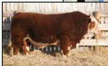
LS Legacy 565M