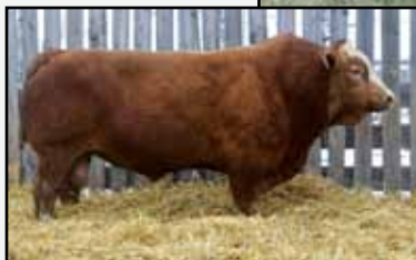
Beech Bros X Man 918X