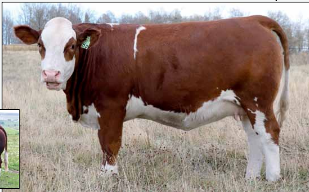
Brink Geronimo A310