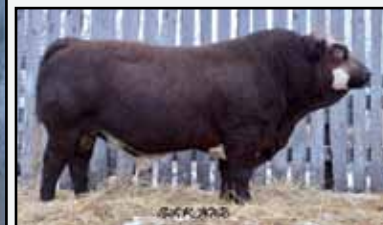
Keato Pld Classified 10A