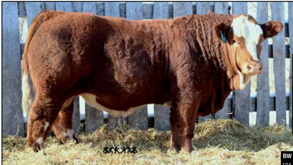
Bar 5 FF Willie 426Y