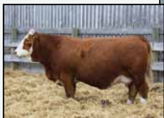
maternal granddam MFI Petra 1019

FULLBLOOD FEMALE 1202278 JNR 781E 19 January 2017