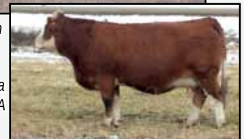
Virginia Annabelle 300A

Bred AI March 25 to JNR's Titanium 1143132. Exposed April 5-May 15 to same. Observed bred April 13. Ultra sound safe to Apr 13 breeding.