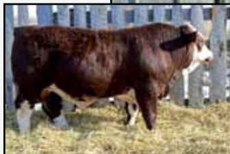
Directors Cut - genetic full brother