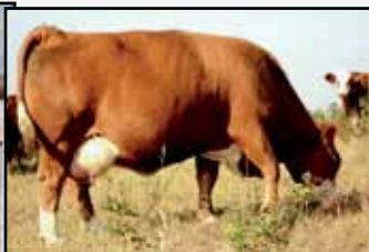
maternal granddam JNR 826U