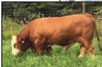
Keato Kaptain 19C