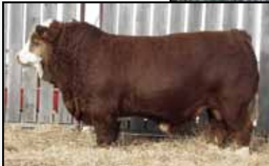
Double Bar D Kitimat