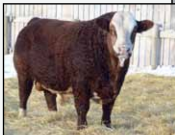
Brink Bullet Proof

FULLBLOOD FEMALE 1202235 JNR 754E 09 January 2017