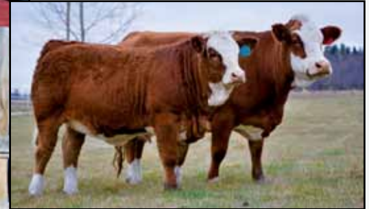
BEE 620D & dam